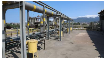
Equipment measuring the quality of gas being produced