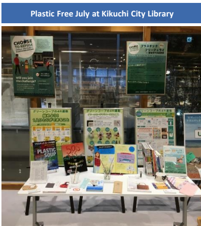
Plastic Free July at Kikuchi City Library