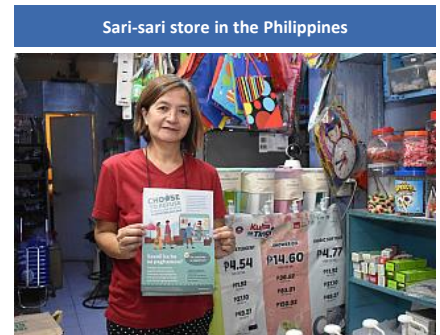
Sari-sari store in the Philippines

Resources have been created in Tagalog (and one poster in Bisaya) to share Plastic Free July with friends, family and colleagues in the Philippines and help end plastic waste.