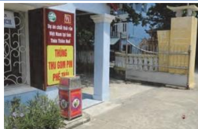
Collection container for end-of-life dry batteries